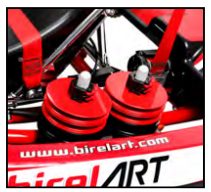
WEIGHT HOLDER WITH WEIGHTS